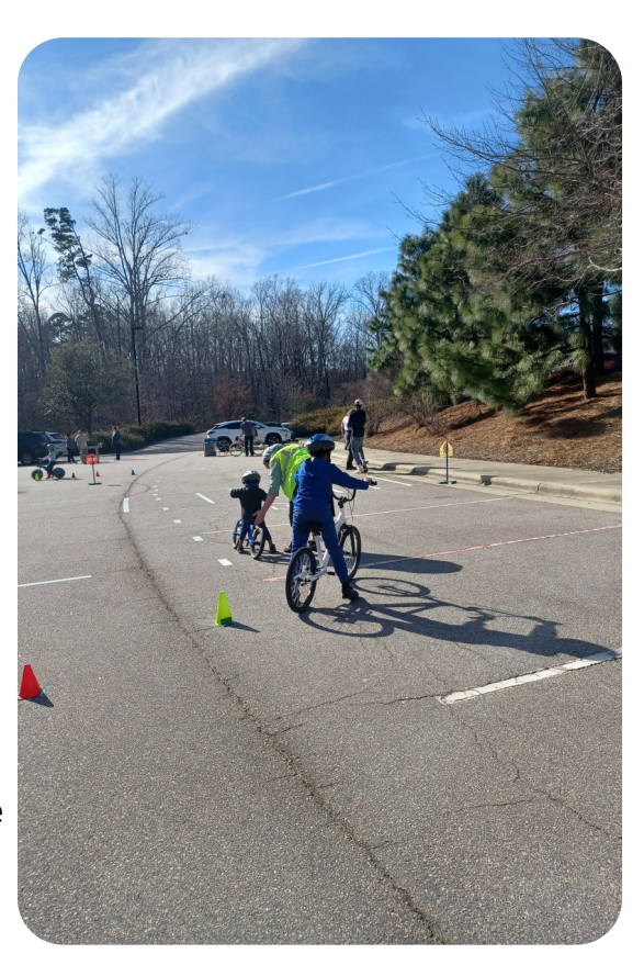
Learn to Ride Event

The background and logistical work that went into making this event a success was key. We are now in a position to host future Learn to Ride events using the fleet of used bikes collected and repaired. Additionally we learned several important lessons about running the event more efficiently that we detail on the next page. This first Learn to Ride event is just the beginning of what we hope will be a larger shift in Raleigh towards safe, multi-modal commuting.