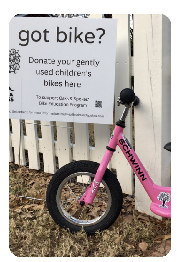
Gently used bike donation site