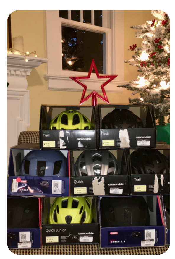
Helmet donation from Raleigh bike Shop, Cycle Logic