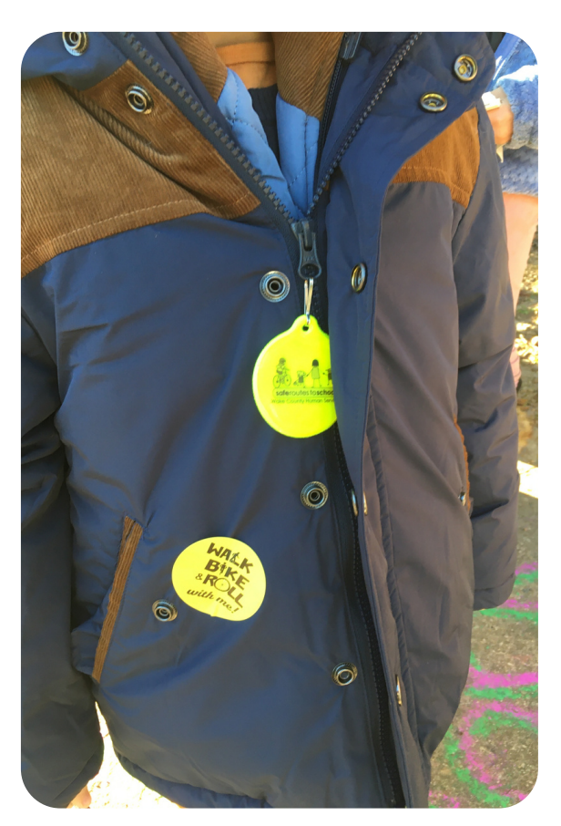
Walk & Roll to School Day prizes!