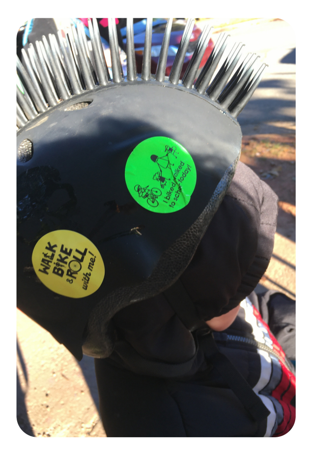
Douglas Elementary Walk & Roll to School Day Pride